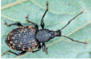
Black vine weevil adult