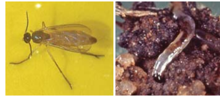
Fungus gnat adult female Fungus gnat larvae