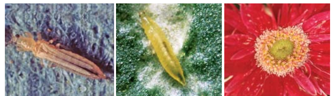
Adult western flower thrips Immature western flower thrips Gerbera flower damaged by western flower thrips

Thrips feed by piercing plant tissue and sucking fluids. Feeding injury distorts and discolors leaves and flowers. Feeding on pollen by some thrips species (e.g.