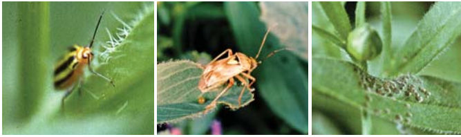
Four-lined plant bug Tarnished plant bug adult Plant bug feeding injury

Plant bugs are so called “true bugs.” Plant bugs are sucking pests that feed on plant fluids. Damage includes a variety of symptoms, from dark leaf spots to deformed terminal growth. One of the most serious pests among the true bugs is the tarnished plant bug, Lygus lineolaris . This pest occurs throughout much of North America and has been recorded from nearly 400 host plants, including many herbaceous and woody ornamentals.