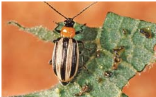
Leaf beetle adult and feeding damage

There are numerous species of beetles in this family – about 1500 – that feed on plant leaves, including those on many ornamental plants. Some of the more important members of this group for ornamentals producers include cucumber beetles (also known as corn rootworm adults), elm leaf beetles, viburnum leaf beetles, cranberry rootworm adults and flea beetles.