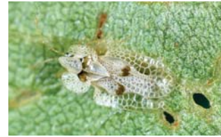
Lace bug adult

Lace bugs are sucking insects that feed on plant fluids. Feeding injury causes yellow spotting on leaves, which may turn brown and fall off the plants.