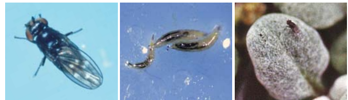
Shore fly adult Shore fly larvae Shore fly adult and black fecal spots on leaf

Shore fly adults are small flies that resemble fruit flies in size and shape, but have black bodies with red eyes. When at rest white spots can be seen on the wings. Both adults and larvae feed on algae, bacteria and protozoa. Direct feeding injury to plants is rare, but adults may help to spread plant pathogens.