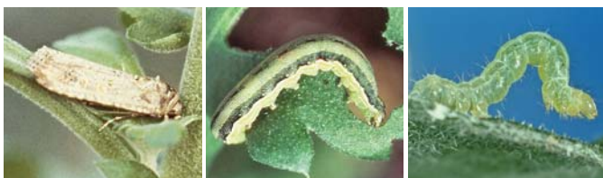
Adult beet armyworm Beet armyworm larva Cabbage looper larva

Order Lepidoptera, Several families such as Noctuidae, Tortricidae, Pyralidae, Arctiidae