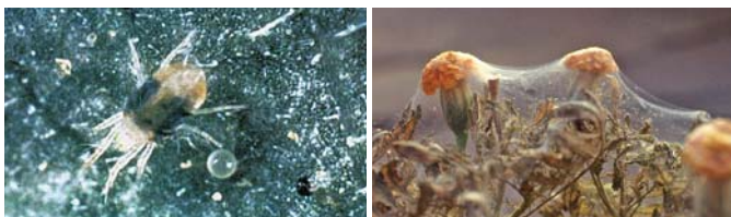
Spider mite adult female and egg