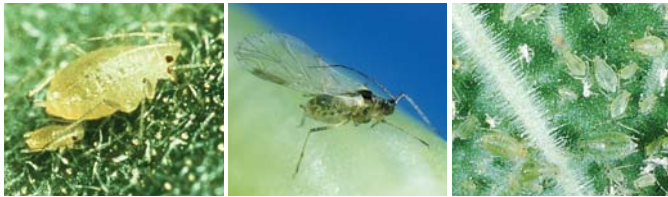
Adult aphid and nymph Adult winged aphid Aphids and white cast-off skins

Aphids are sucking insects that feed on plant fluids. The presence of aphids or white cast-off skins on leaves or flowers may reduce plants value. Heavy infestations will reduce plant growth. Honeydew produced by aphids makes leaves and fruits sticky and is a substrate for black sooty fungus. Many aphid species transmit viruses affecting vegetable and ornamental plants.