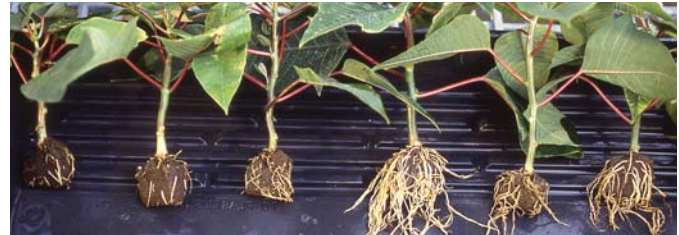
Poinsettias with roots damaged by fungus gnat larvae

Fungus gnat adults are small midge-like flies that cause no direct plant damage. However, the larvae can feed on roots or root hairs, stunting or killing young plants. Fungus gnats have been associated with several plant pathogens. Larval feeding damage may provide an entry point for plant pathogens.