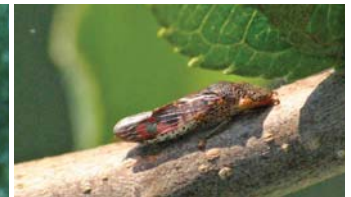
Glassywinged sharpshooter adult

Some of the most important leafhopper and sharpshooter species in greenhouse and nursery production include the potato leafhopper, rose leafhopper, aster leafhopper and glassywinged sharpshooter.