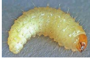
Black vine weevil larva

Root weevils are larvae of snout nosed beetles – usually flightless and all females – that feed on roots of a wide range of plants. Several species can be serious pests in nurseries and greenhouses. Some root weevil pests include the black vine weevil, strawberry root weevil, rough strawberry root weevil, clay colored weevil and woods weevil. Depending on the species, adults range from 1/5 to 1/2 inch long.