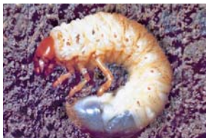
White grub larva