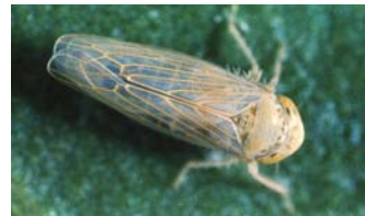
Rose leafhopper adult