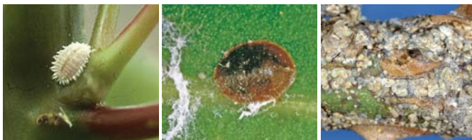
Citrus mealybug Soft scale female Armored scales on rose stem

Order Hemiptera, Family Pseudococcidae – Order Hemiptera, Family Coccidae – Order Hemiptera, Family Diaspididae