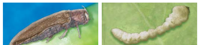
Flatheaded borer adult

Order Coleoptera Families Buprestidae and Cerambycidae