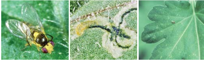
Leafminer adult Leafminer larva in leaf mine Leafminer adult and leaf punctures for feeding and egg laying

Primary leafminer injury is from the larvae feeding within leaves, making a narrow winding trail, or mine. Larval mines disfigure ornamental plants and vegetable plants may have reduced yields if populations are high. During heavy infestations, larvae may produce leaf mines in flowers.