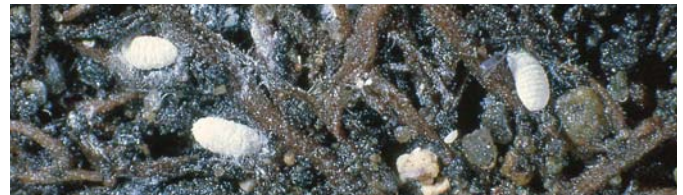
Root mealybugs on outside of root ball

Root mealybugs are in the Genus Rhizoecus . They are sucking pests similar to other mealybugs that feed on stems and leaves, but are adapted to feed on plant roots. Adults resemble small insects that have been rolled in white flour. Adults and their cottony egg masses are usually on the outside of the root ball, and can be seen when the plant is lifted from the container.